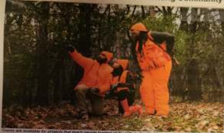
Funding is available for projects that teach people hunting skills.

MADISON, Wis. — The Wisconsin Department of Natural Resources (DNR) is now accepting applications for this year's round of funding for the Hunting Recruitment, Retention and Reactivation (R3) grant program. Funding from the grant program is used to help grow the number of hunters in Wisconsin and expand hunter activities.