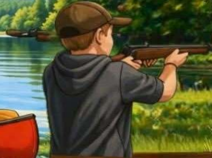
BB Gun Shooting